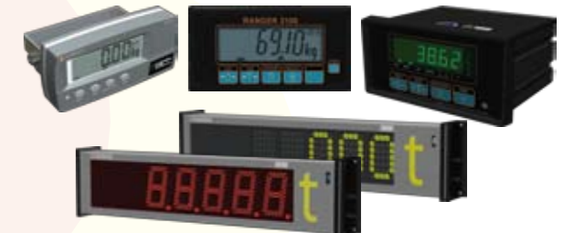
DIGITAL INDICATORS & REMOTE DISPLAYS