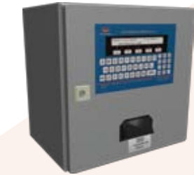
DRIVER CONTROL STATION