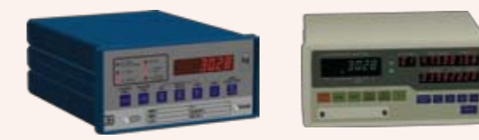
REPLACEMENT INDICATOR BRANDS