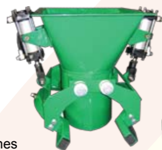
OPEN-MOUTH BAGGING MACHINE WITH BAG CLAMP