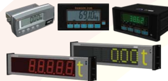
RINSTRUM INTELLIGENT INDICATORS & LARGE-DIGIT INDICATORS