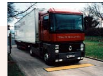
IN-MOTION AXLE WEIGHERS