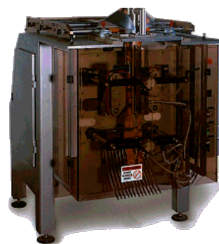
VERTICAL FORM, FILL AND SEAL MACHINE