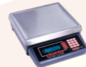
SCALES AND BALANCES