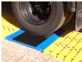
PORTABLE WHEEL WEIGHERS