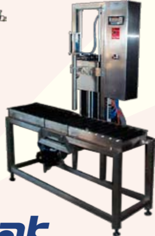
LIQUID FILLING LINE