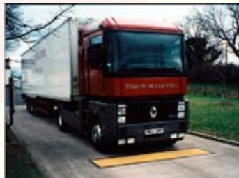
IN-MOTION AXLE WEIGHERS