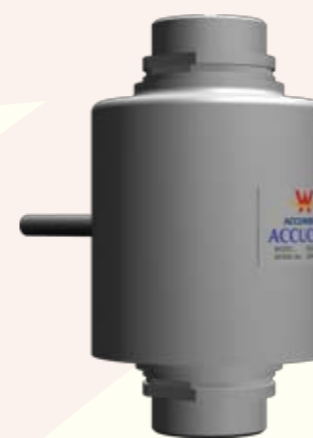
ACCUCELL WEIGHBRIDGE LOADCELL