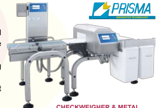
CHECKWEIGHER & METAL DETECTOR COMBINATION