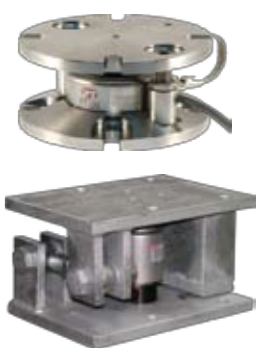
SILLO MOUNTING KITS