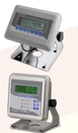
EVERY WEIGH-TRONIX RANGE OF INDICATORS