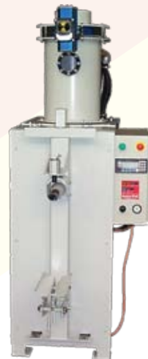
VALVE BAGGING MACHINE