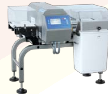
METAL DETECTORS, X-RAY MACHINES, HIGH-SPEED CHECK-WEIGHERS